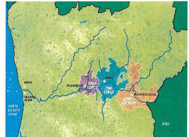
and Douro Valley in Northern Portugal